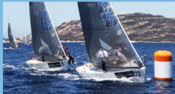
1,2,3,4,6,7*,8,9*,10 ITALIAN NATIONALS Ignazio Bonanno