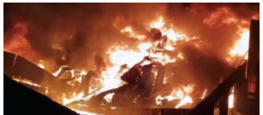
Fire in Warehouse