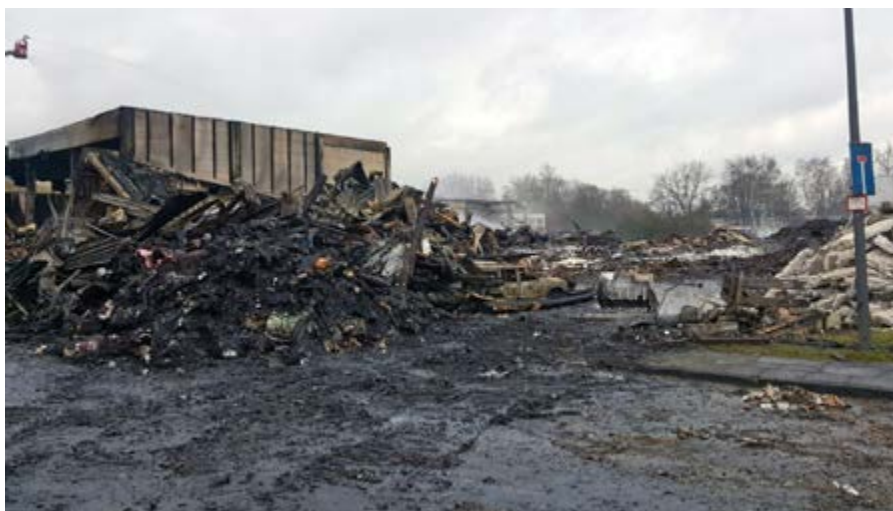
Part of the warehouse after the fire