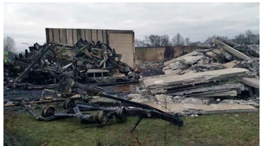
Not much left from the trailer